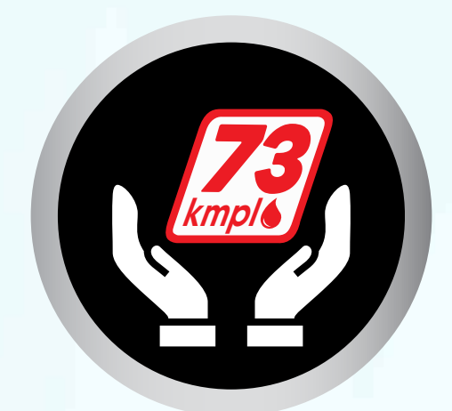
BEST-IN-CLASS MILEAGE 73 KM/L