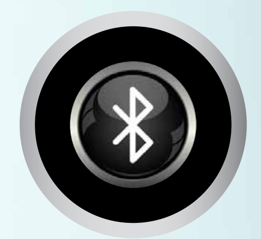
BLUETOOTH CALL AND SMS ALERTS