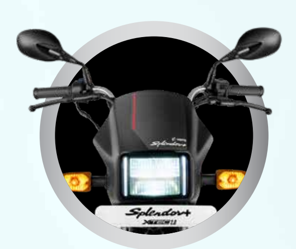
LED HEADLIGHT WITH HIPL