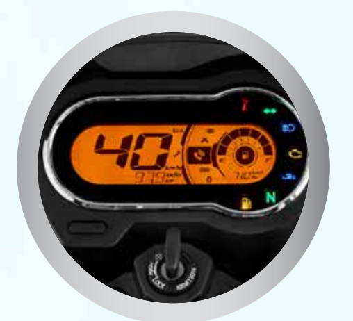
FULLY DIGITAL INSTRUMENT CLUSTER WITH RTMI